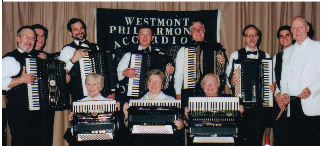
Westmont Philharmonic Accordion Orchestra