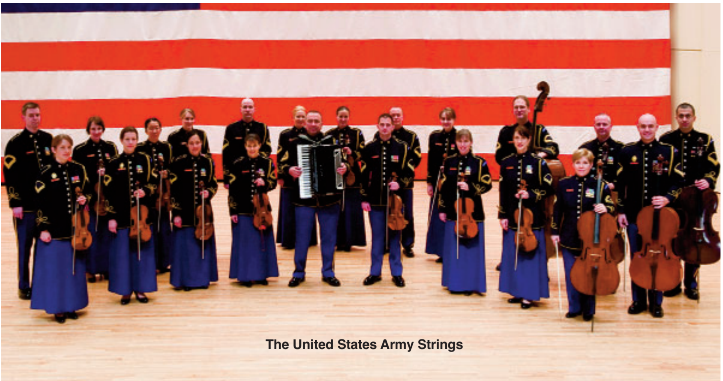
The United States Army Strings

Registration forms, a downloadable flyer and other information on the festival are enclosed and also available on the AAA website – www.ameraccord.com