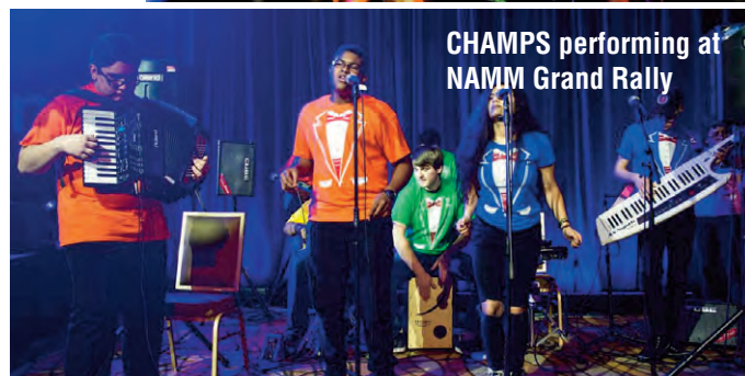
CHAMPS performing at NAMM Grand Rally