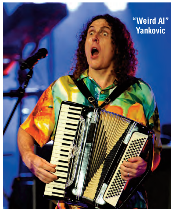
"Weird AI" Yankovic