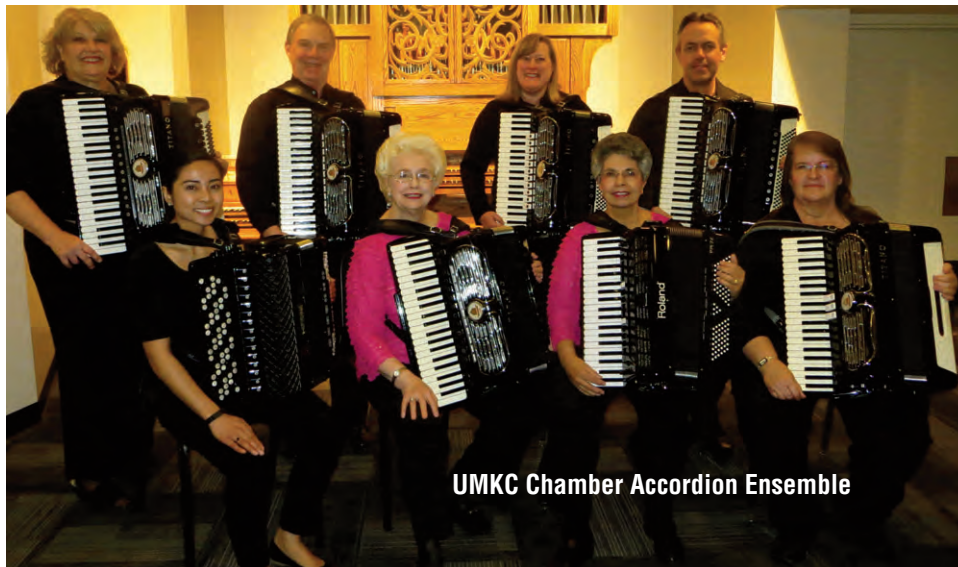
UMKC Chamber Accordion Ensemble