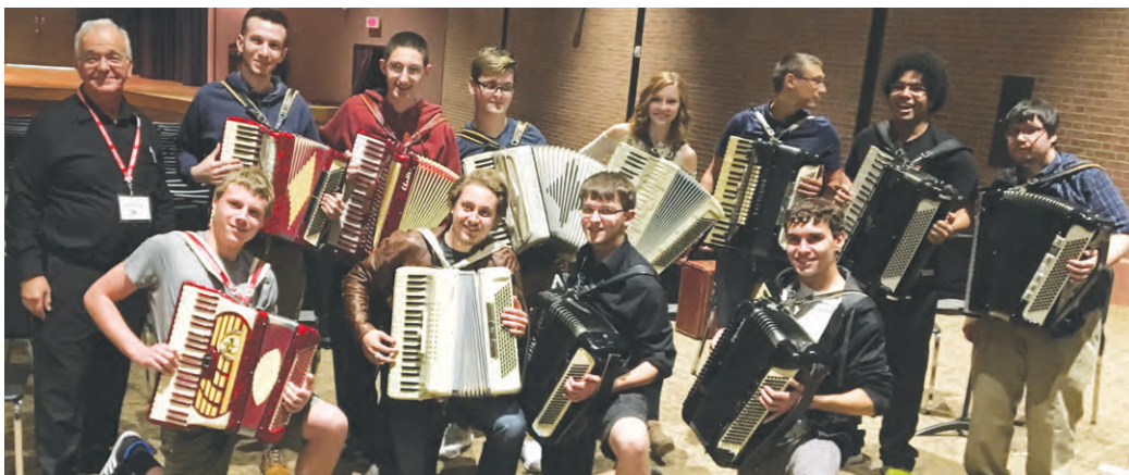
Wolcott Seniors pose for year book picture.