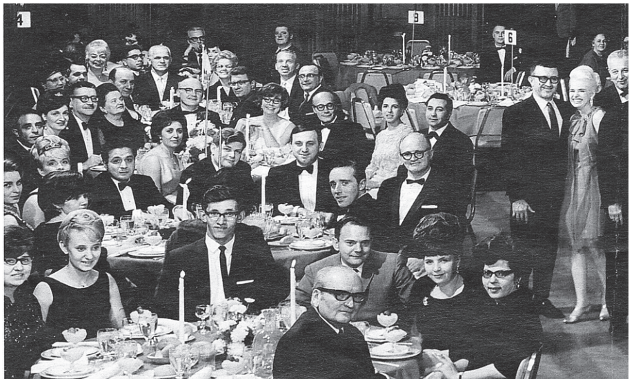
AAA Annual Dinner and Dance – Statler Hilton Hotel, NYC – November 20, 1966

dream. Our success brings us a profitable, happy and secure future. More than this – the accordion and its patrons have gained respect.