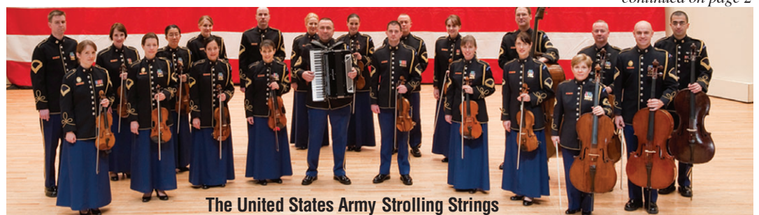
The United States Army Strolling Strings