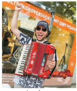
continued on next page

The previous longest marathon accordion playing lasted 31 hours 25 minutes and was achieved by Anssi Laitinen